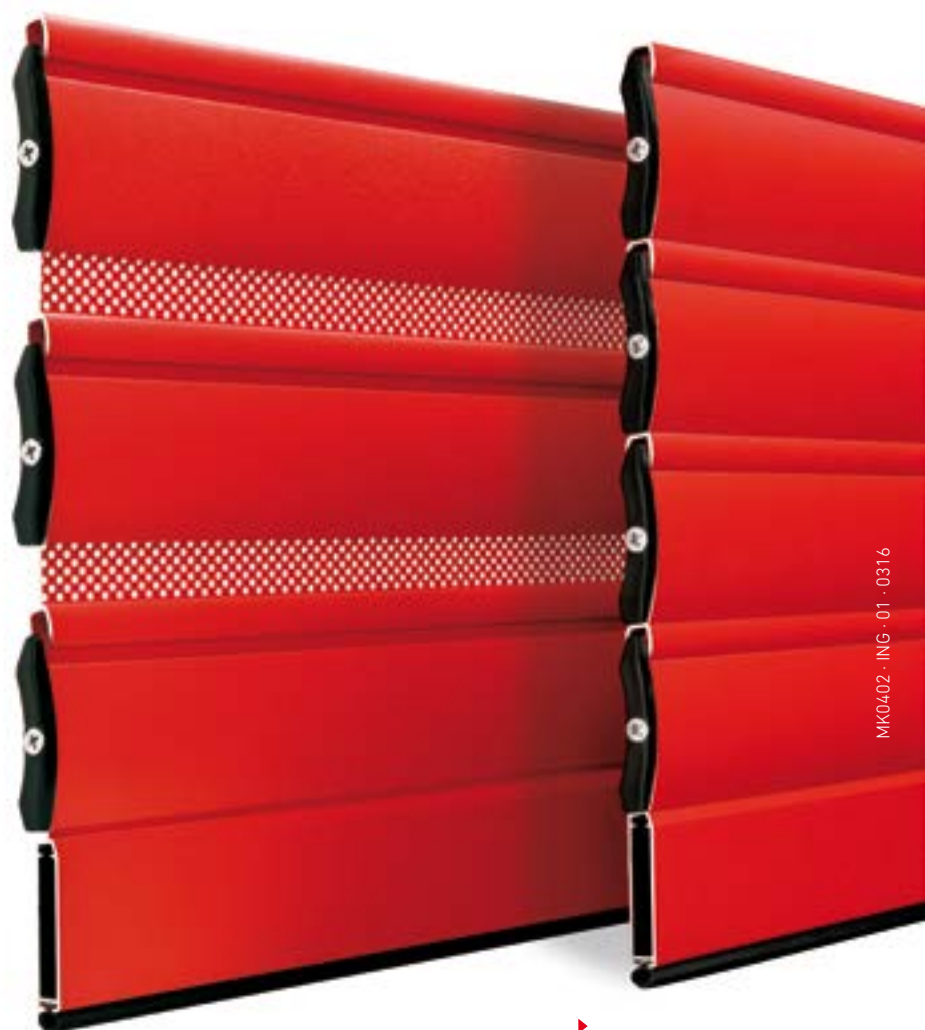
▶ PM-49 microperforated in RAL 3020 texture